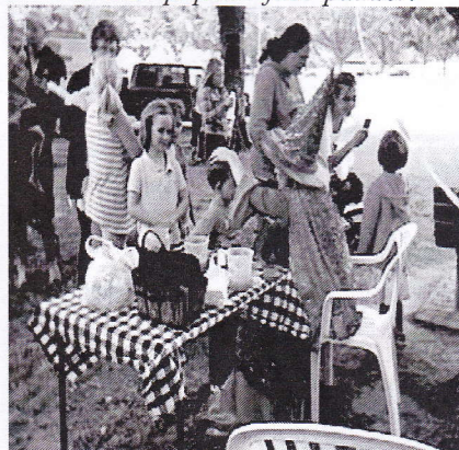
The ever popular face-painter.