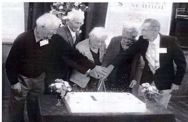
First day pupils cut the Jubilee cake.